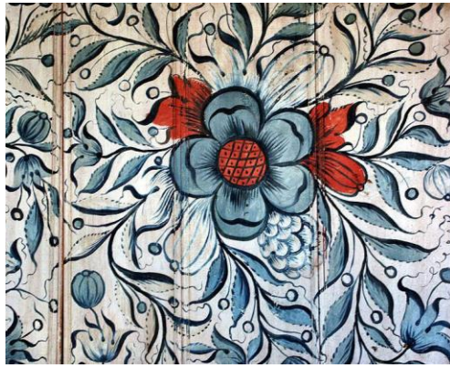
A detail from the Uvdal stave church in Buskerud county, Norway