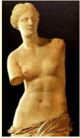
Venus from Milo

The parrot said, "The same people who name their Rottweiler Jesus."